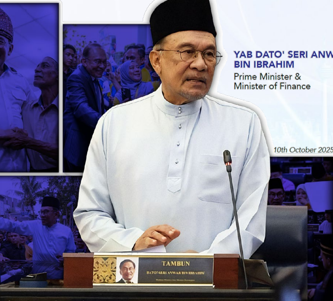
YAB DATO' SERI ANWAR BIN IBRAHIM Prime Minister & Minister of Finance