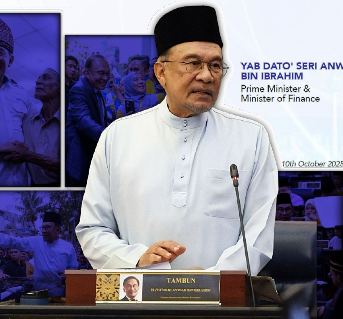
YAB DATO' SERI ANWAR BIN IBRAHIM Prime Minister & Minister of Finance